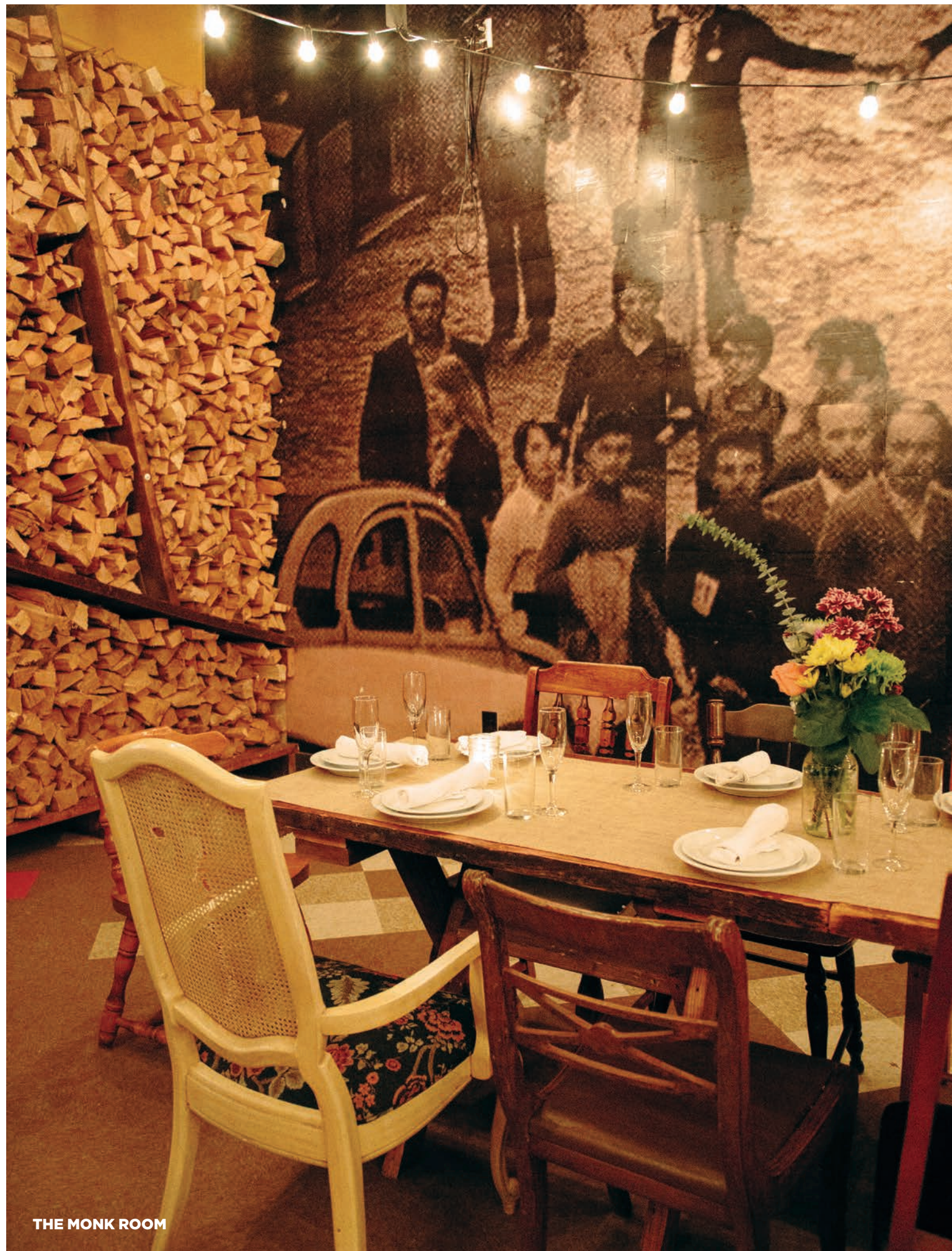
THE MONK ROOM